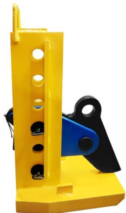
Plate clamp for horizontal lifting of bound steel sheet bundles or individual thick steel plates. Used in pairs.