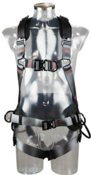
Work positioning D-ring