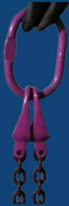
Marking is illegible. Missing.