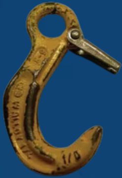
Overload deformation of the hook.