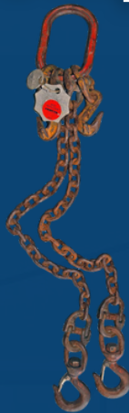
Rusty sling components.