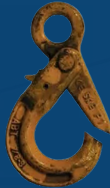
Worn latch, the hook does not close properly.