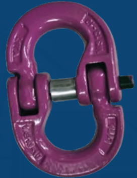
Protruding connection pin.