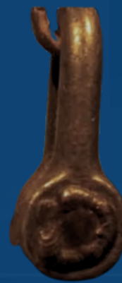
Welding lifting components is not allowed!