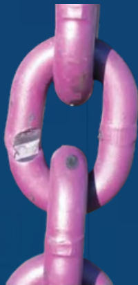
Cuts, material loss, cracks.