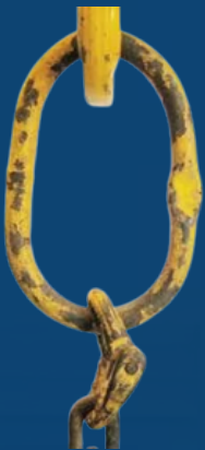
Deformation caused by overload.